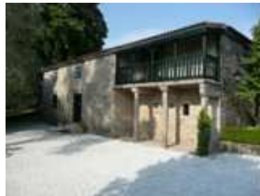
House of Rosalía de Castro