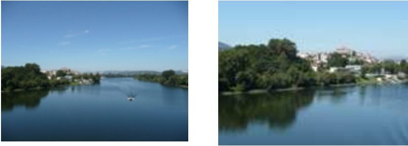
Spain getting closer: crossing the bridge to Tui