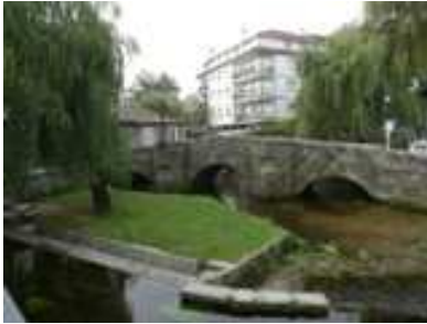
Bridge leaving Caldas de Reis

KSO country trails for about 4 kms passing under the rail bridge high above. Cross the N550 after another 1km.