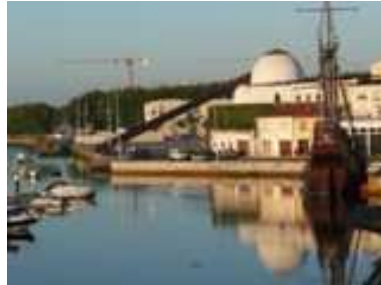
Harbour scenes in Vila do Conde