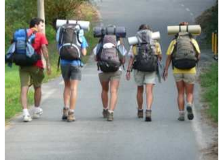
Setting out on the Camino Portugués

(Like the albergue at Teo this hostel may be useful to pilgrims wishing a short day before departing for Santiago and the Pilgrims' Mass the next day)