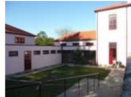
Albergue in Rubiães

Two large dormitories, lounge, large sitting out area and a small kitchen. There are two restaurants within a kilometer or so.