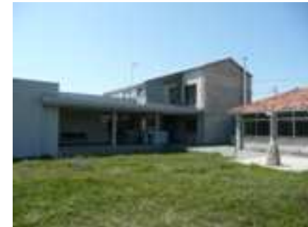
Albergue at Briallos

The route comes back to the N550 at the roundabout at: