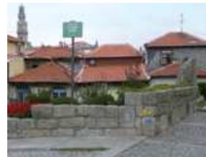
The first yellow and blue arrows

With your back to the West door of the Cathedral proceed down the Calçada de Pedro Pitões as indicated by the first yellow arrow.