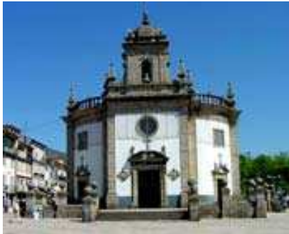
Templo do Bom Jesus - Barcelos