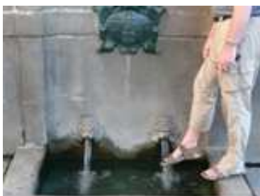
Pilgrim bathing feet in thermal waters