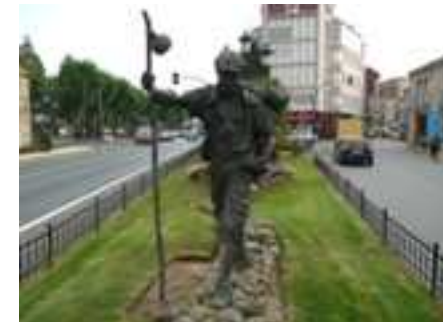
Pilgrim Statue in Padrón

With much information and graphic profiles